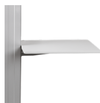
Side shelf for laptop