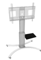
Laptop side shelf