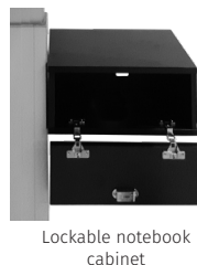
Lockable notebook cabinet